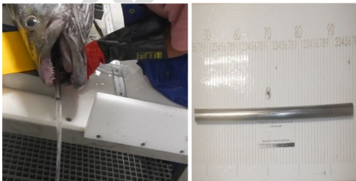
Figure A1: Demonstration of a drain tube used for draining toothfish stomachs of water.