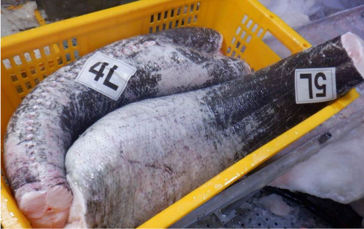
Figure A2: Trunks produced using the HGT processing method.